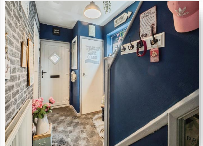
Dunster Road, Mountsorrel