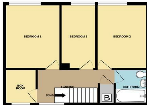
TOTAL FLOOR AREA: 924 sq.ft. (85.8 sq.m.) approx.

Whilst every attempt has been made to ensure the accuracy of the floorplan contained here, measurements of doors, windows, rooms and any other items are approximate and no responsibility is taken for any error, omission or mis-statement. This plan is for illustrative purposes only and should be used as such by any prospective purchaser. The services, systems and appliances shown have not been tested and no guarantee as to their operability or efficiency can be given. Made with Metropix ©2026