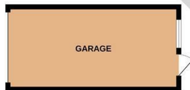
GARAGE 193 sq.ft. (17.9 sq.m.) approx.

TOTAL FLOOR AREA : 1605 sq.ft. (149.1 sq.m.) approx.