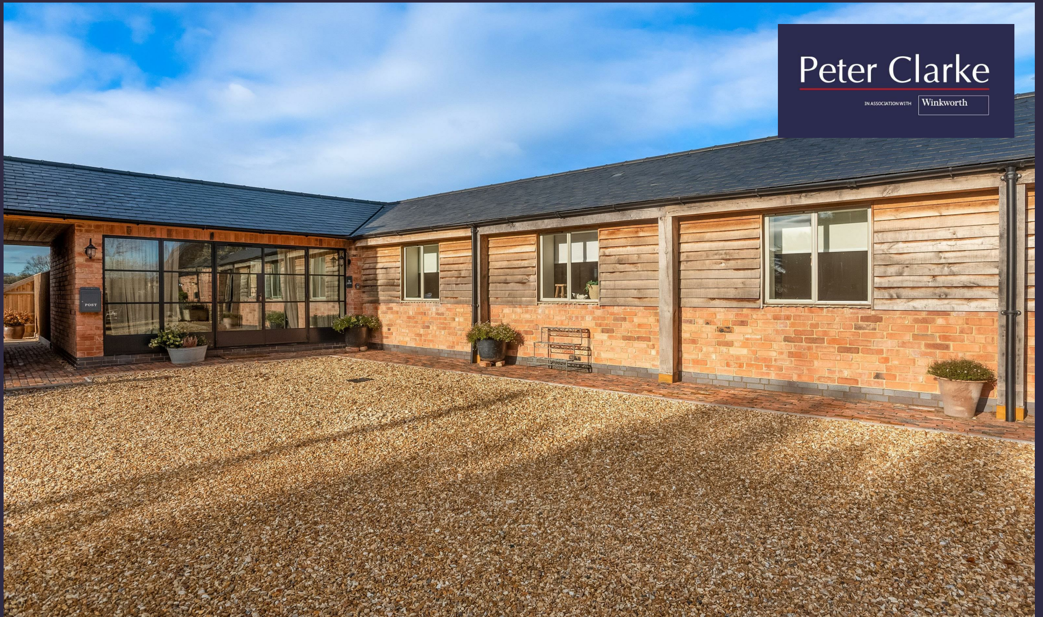
The Calf Pens, Littleworth Farm, Honington, Shipston-on-Stour, CV36 5EL