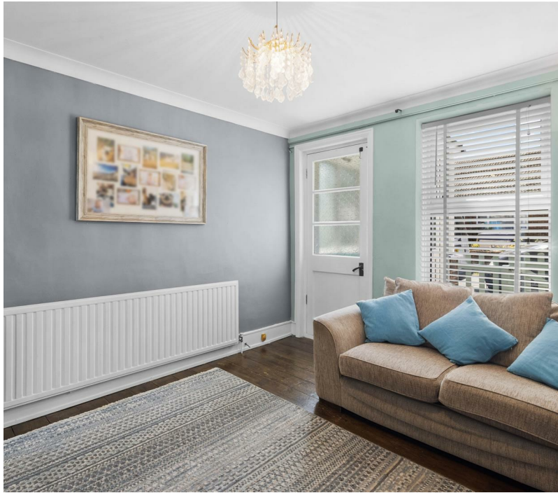
Gordon Road, Hailsham