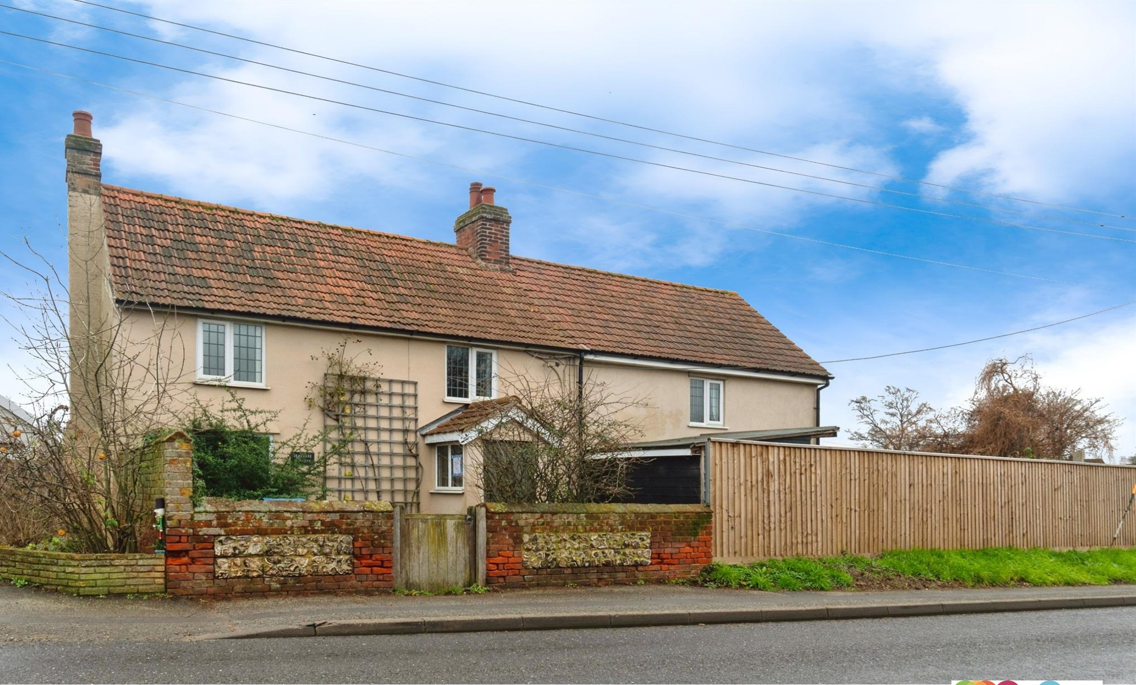
Peartree Cottage, Lavenham Road, Great Waldingfield, Sudbury, CO10 0SE