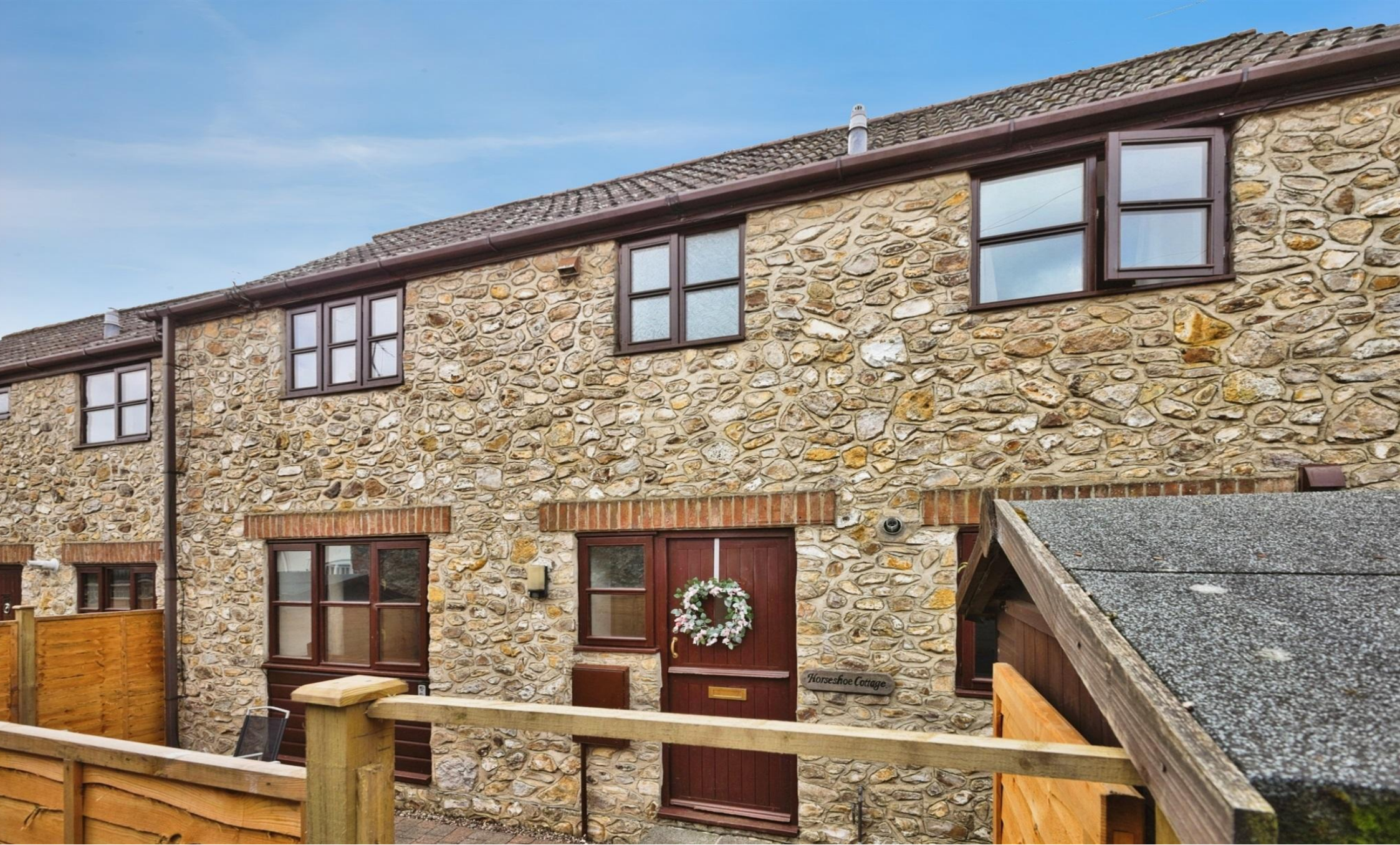
Horseshoe Cottage, Bath Street, Chard TA20 2ET