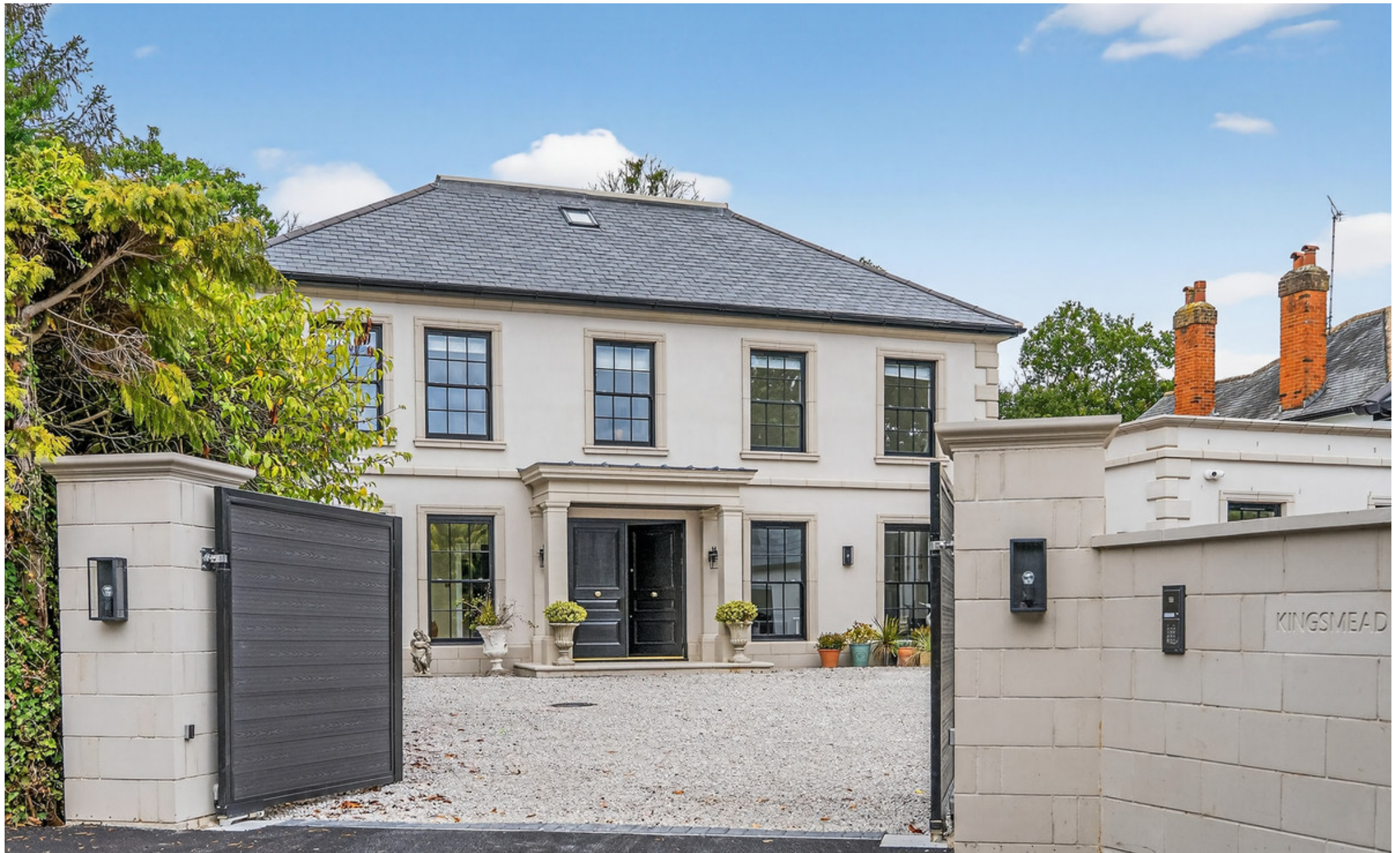
Kingsmead, Slingsby Walk, Harrogate, HG2 8LJ