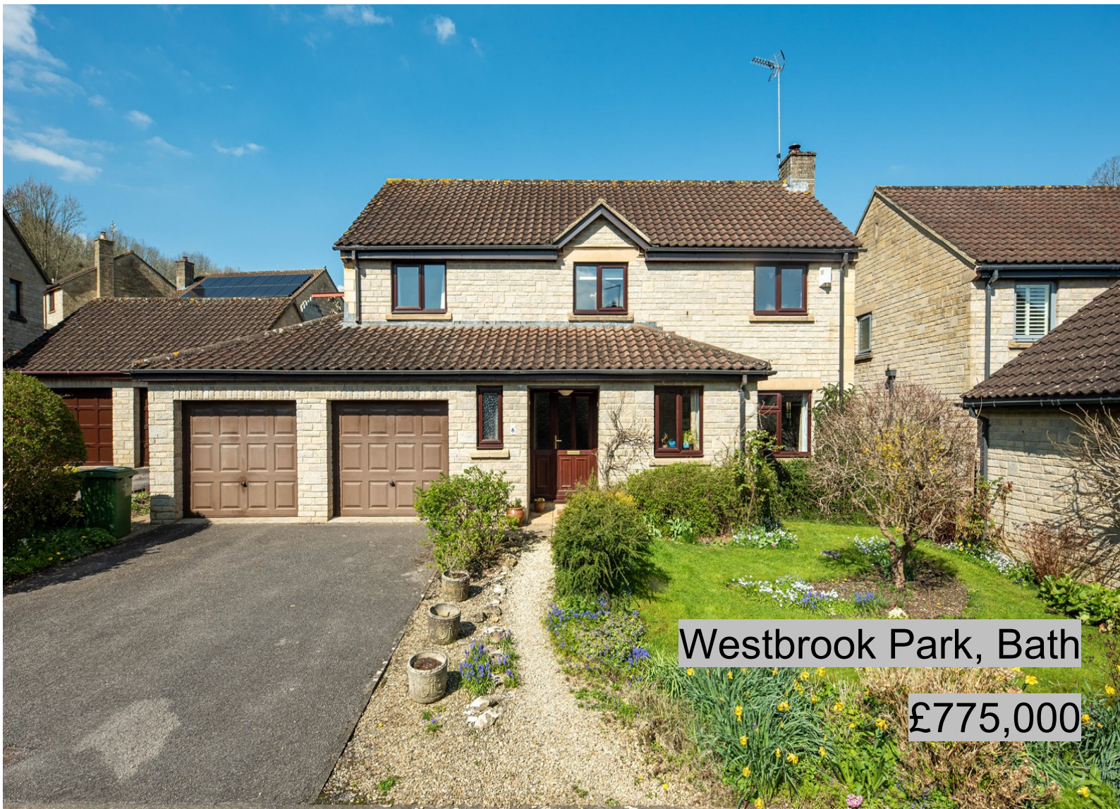
Executive Four Bedroom Detached House. Sought After Location. EPC Grade D.