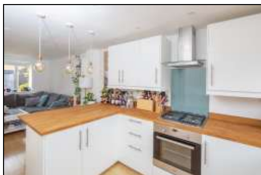
Kitchen Breakfast Room