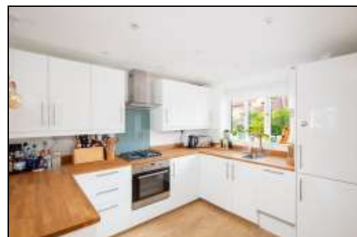
Kitchen Breakfast Room