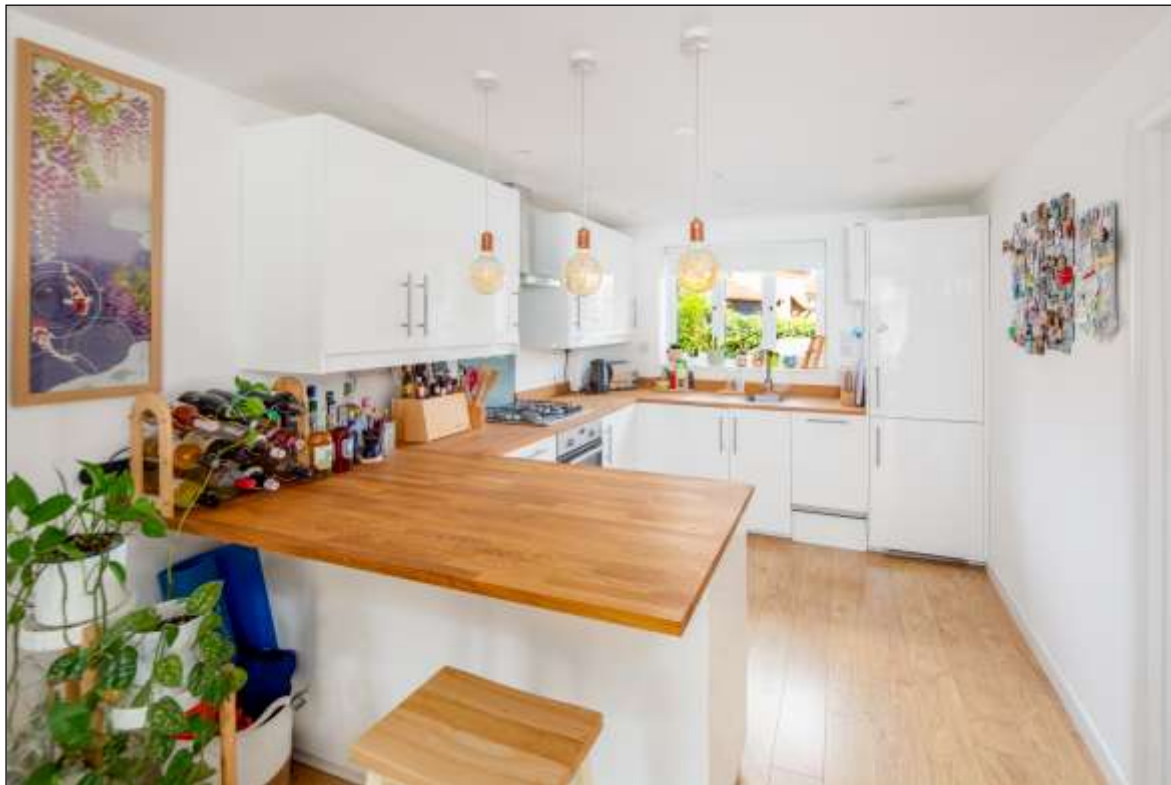
Kitchen Breakfast Room