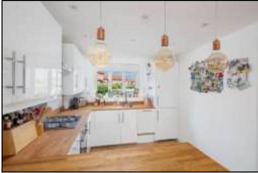
Kitchen Breakfast Room