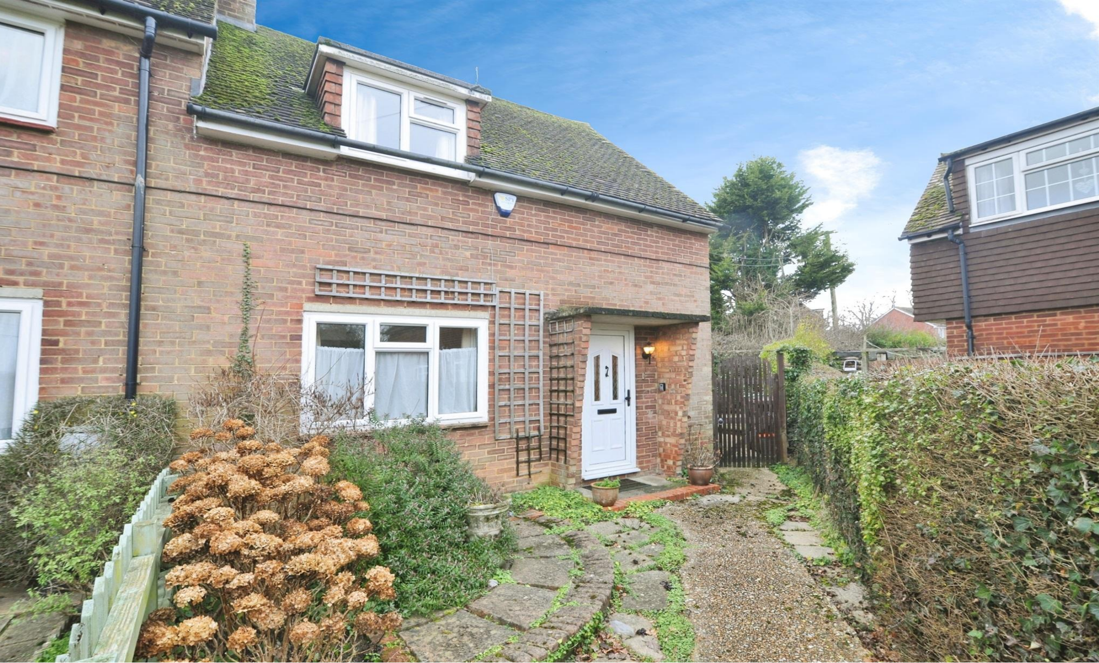
Brickfields - Main Street, Peasmarsh, Rye TN31 6SS