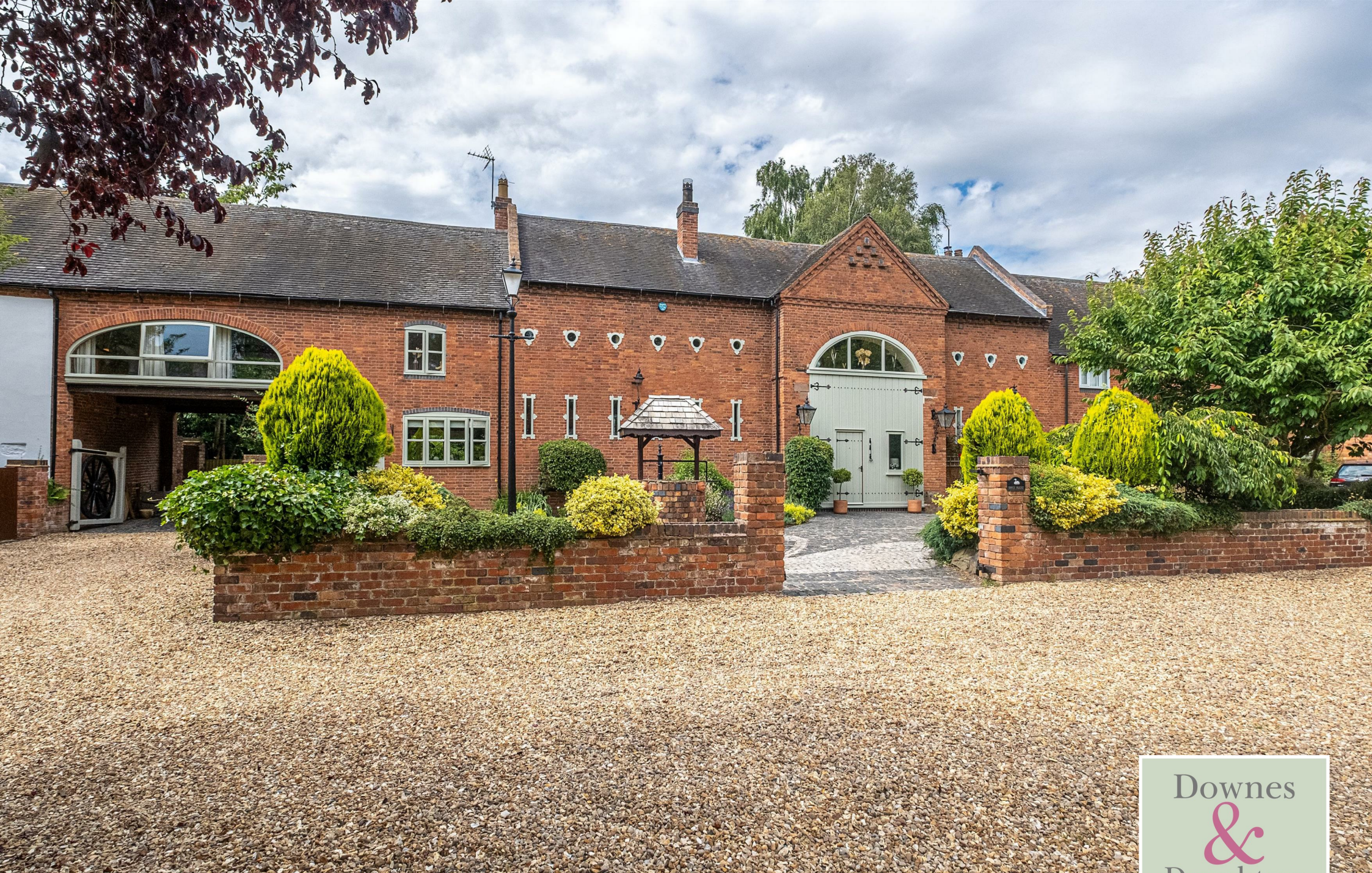
SWAN HOUSE | FISHERWICK WOOD LANE | LICHFIELD