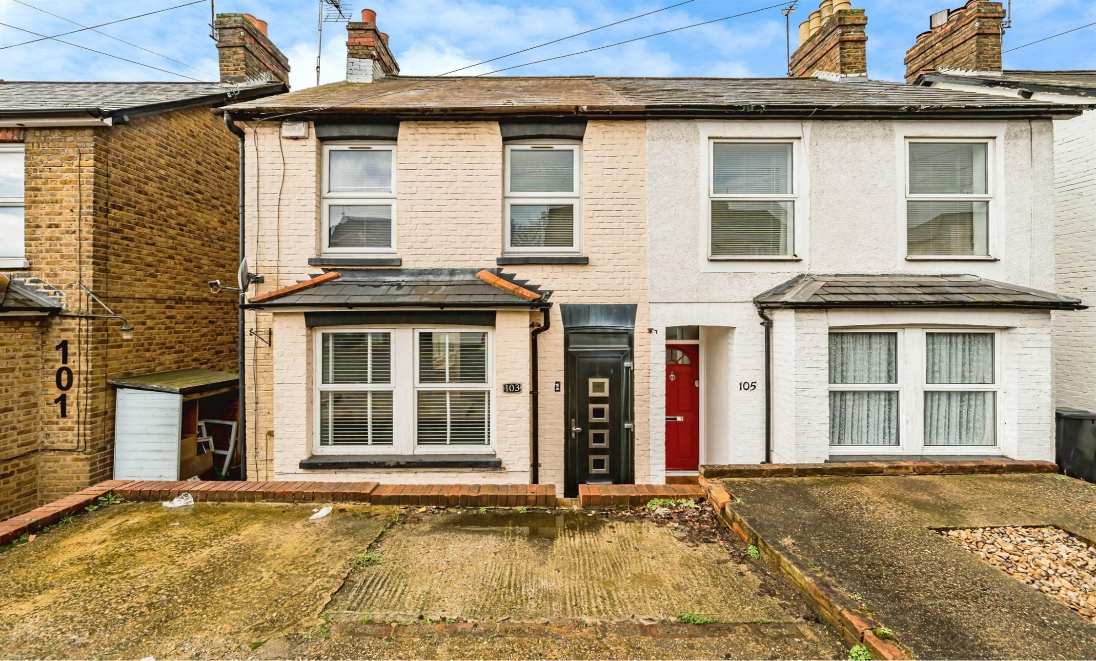
Lent Rise Road, Burnham Slough SL1 7BN