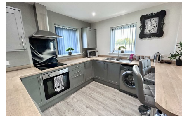
▼ Ground Floor