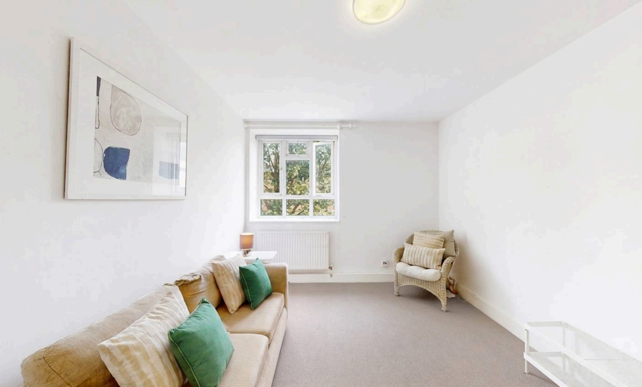
Minford Gardens, West Kensington, W14 £1,870 pcm