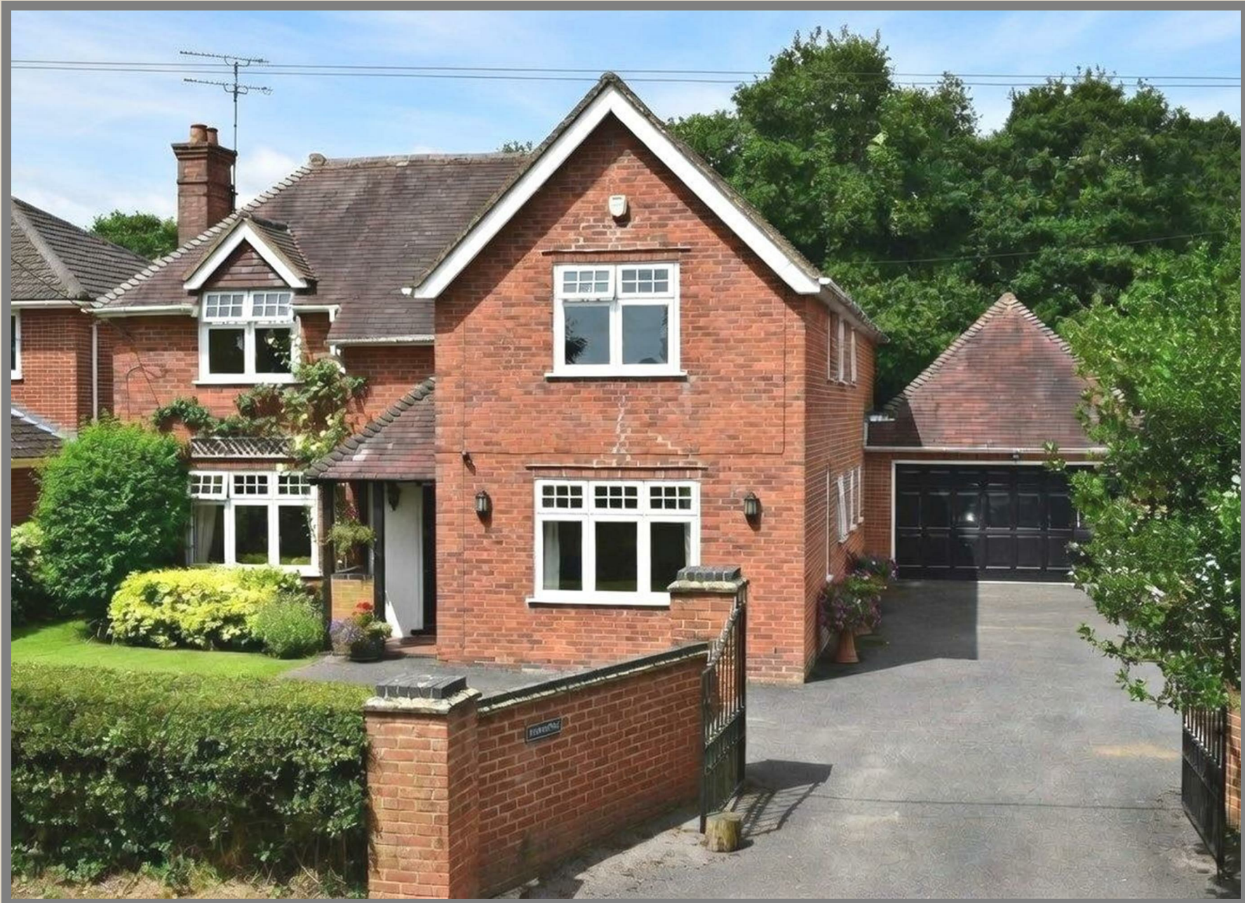
HYAKINTHOS, Newbury, West Berkshire , RG7 6SU