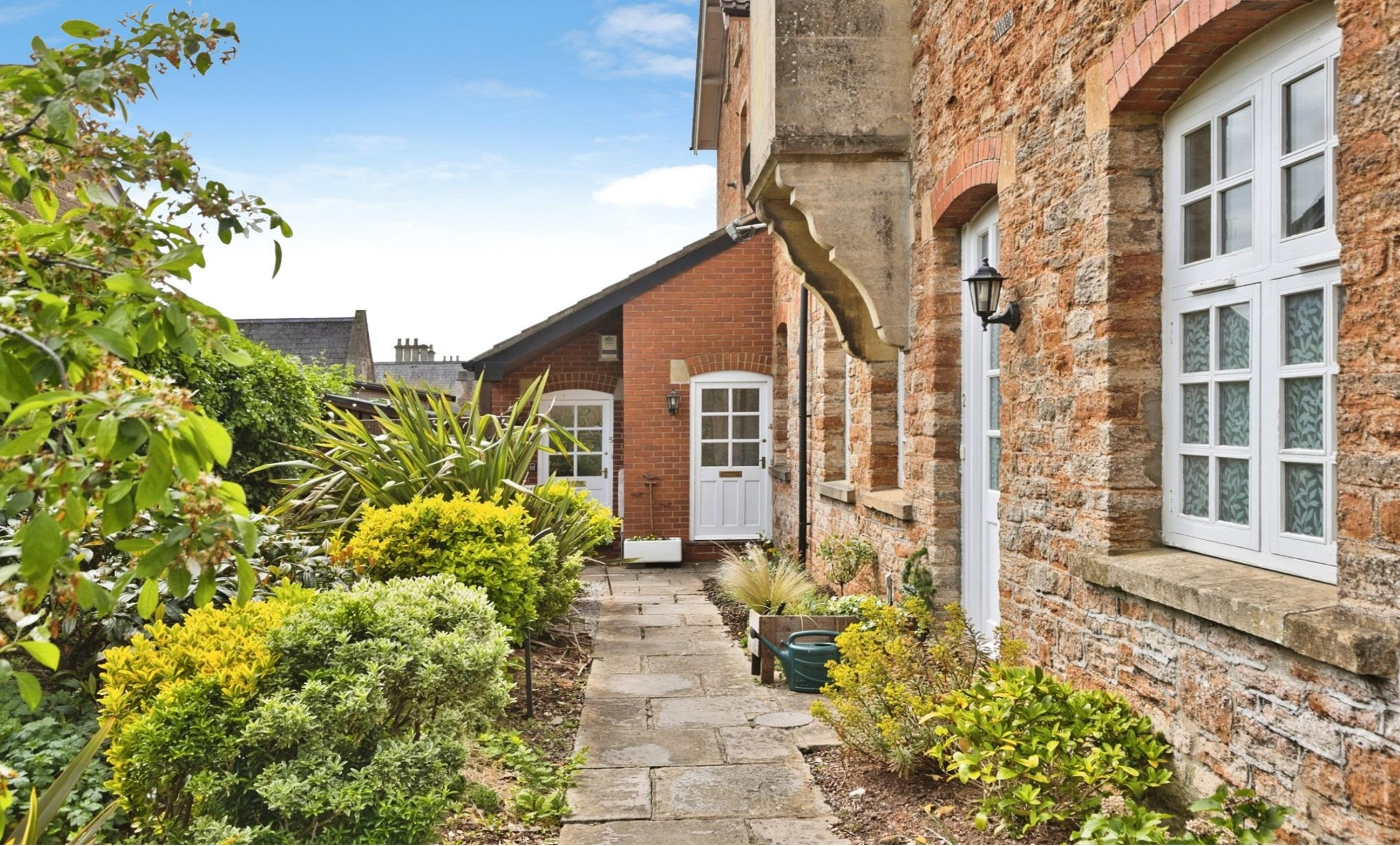
Gilbert Scott Mews, South Horrington Village Wells BA5 3LH