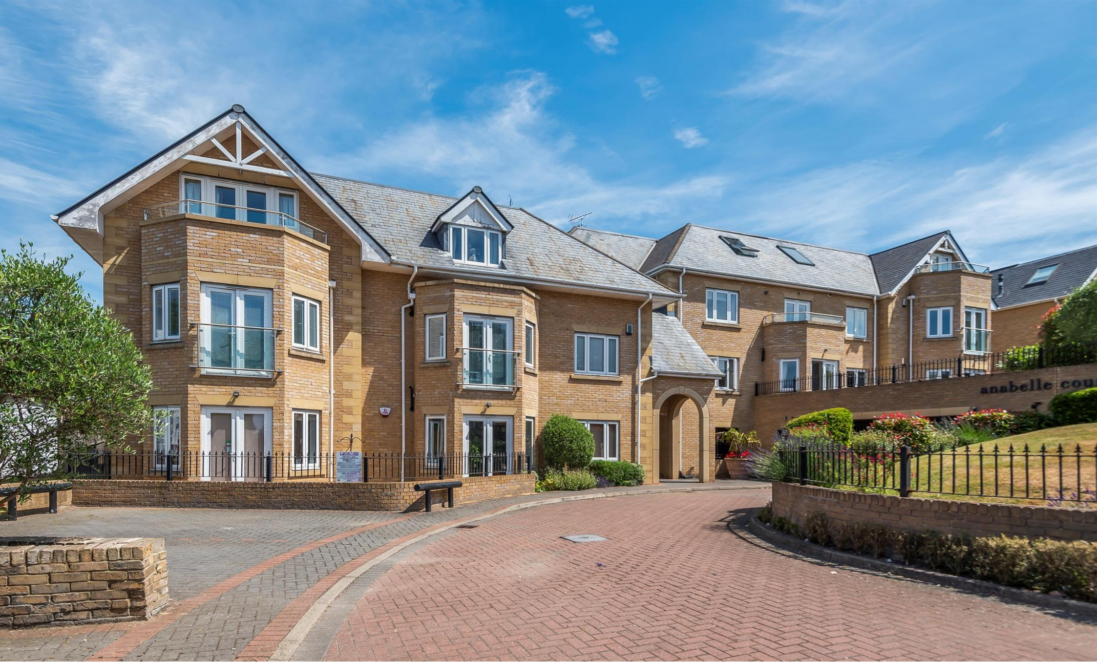
Anabelle Court, Slades Hill, Enfield, EN2 7DL