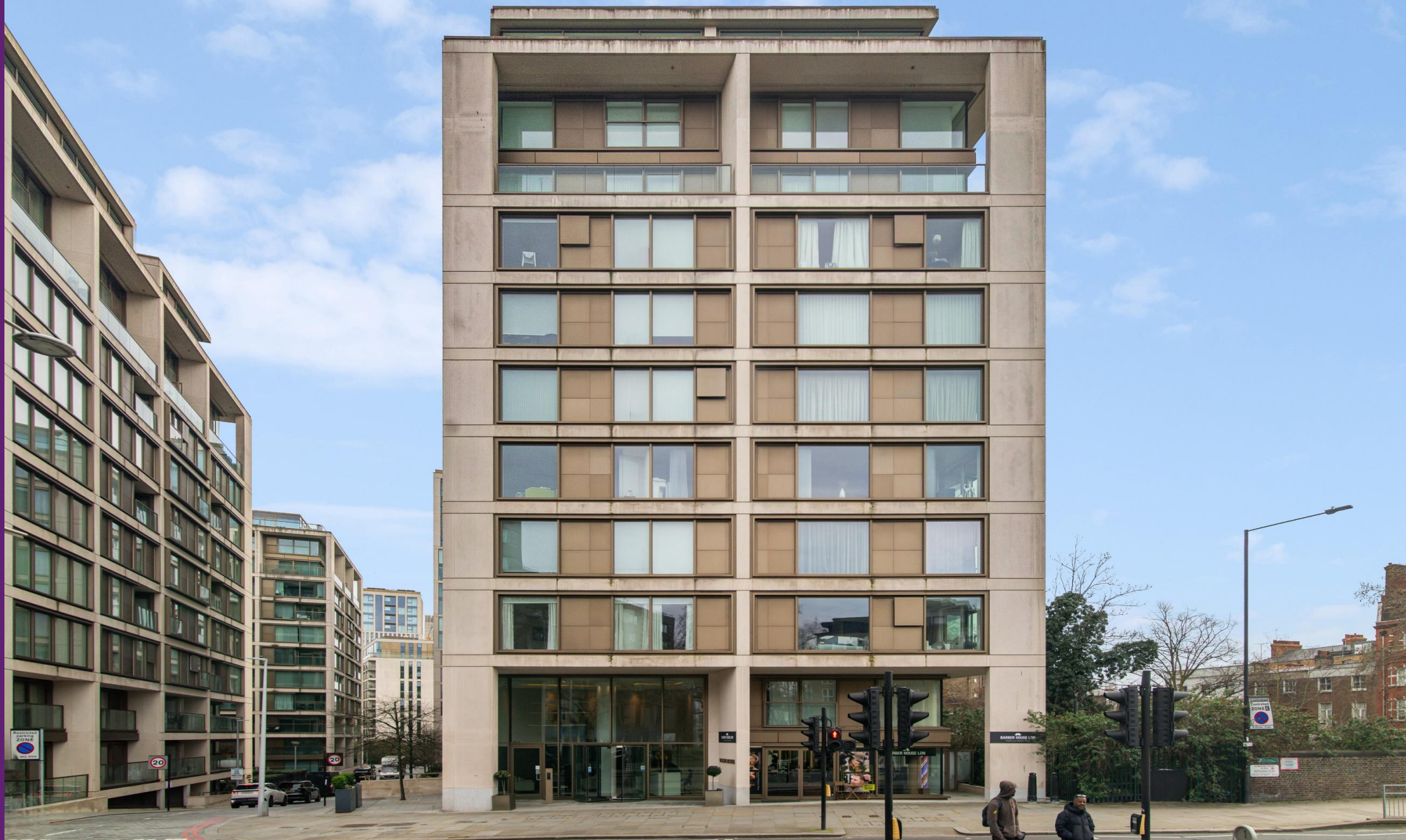
Wolfe House Kensington, W14