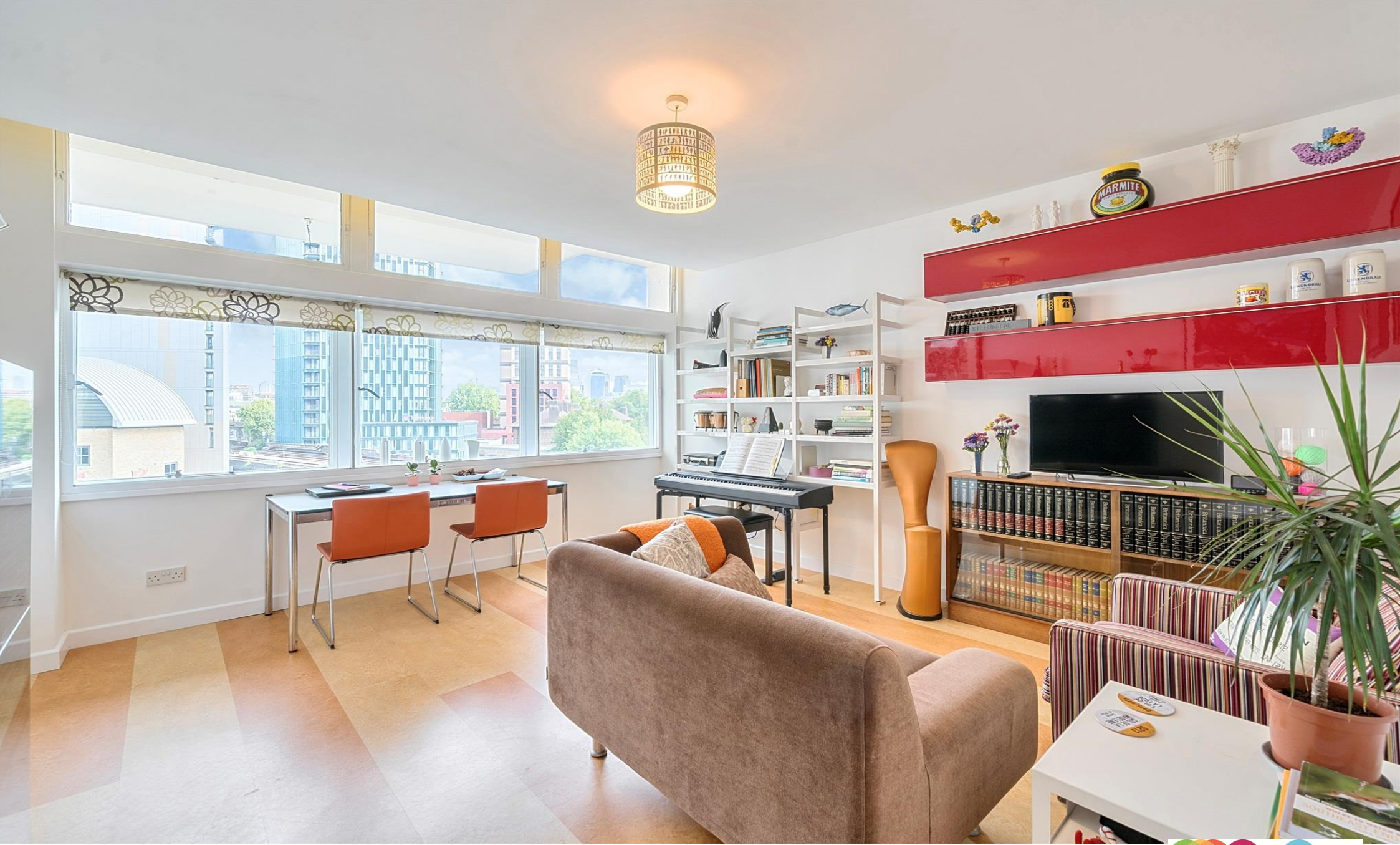
Metro Central Heights Newington Causeway, London SE1