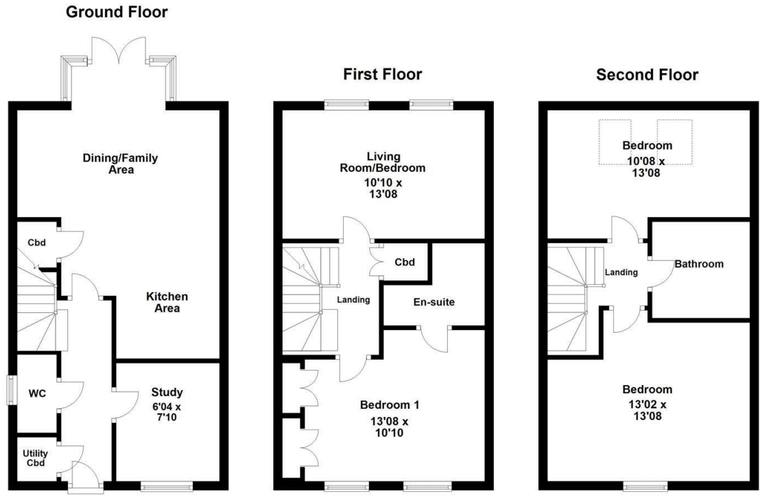
Floor plan not to scale - for guidance purposes only. Floor plan created by Simpson West for their use. Plan produced using PlanUp.