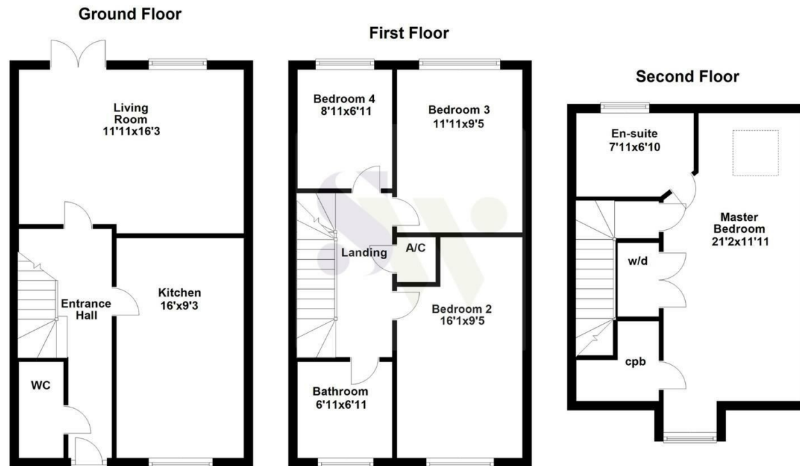
Floor plan not to scale - for guidance purposes only. Plan produced using PlanUp.