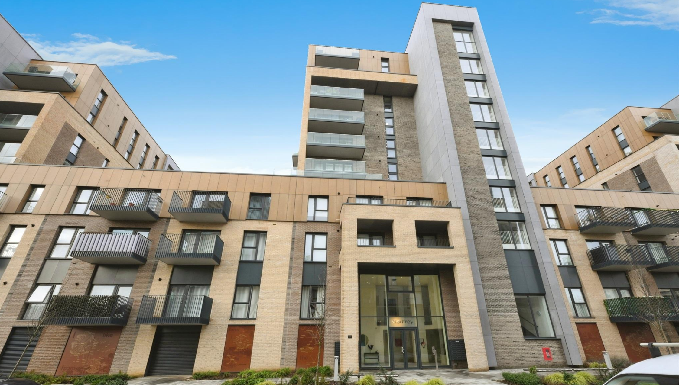
Godfrey House Edinburgh Gate, Harlow CM20 2UF