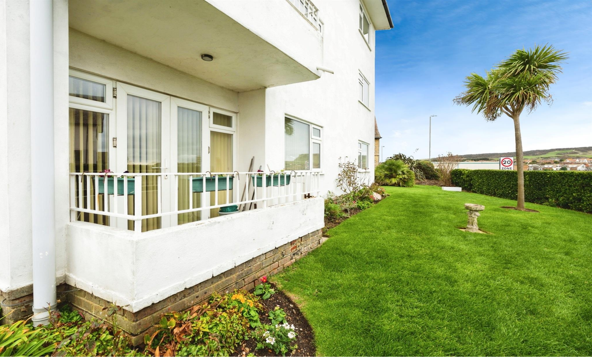
Steyne Close, Seaford, BN25 1QD