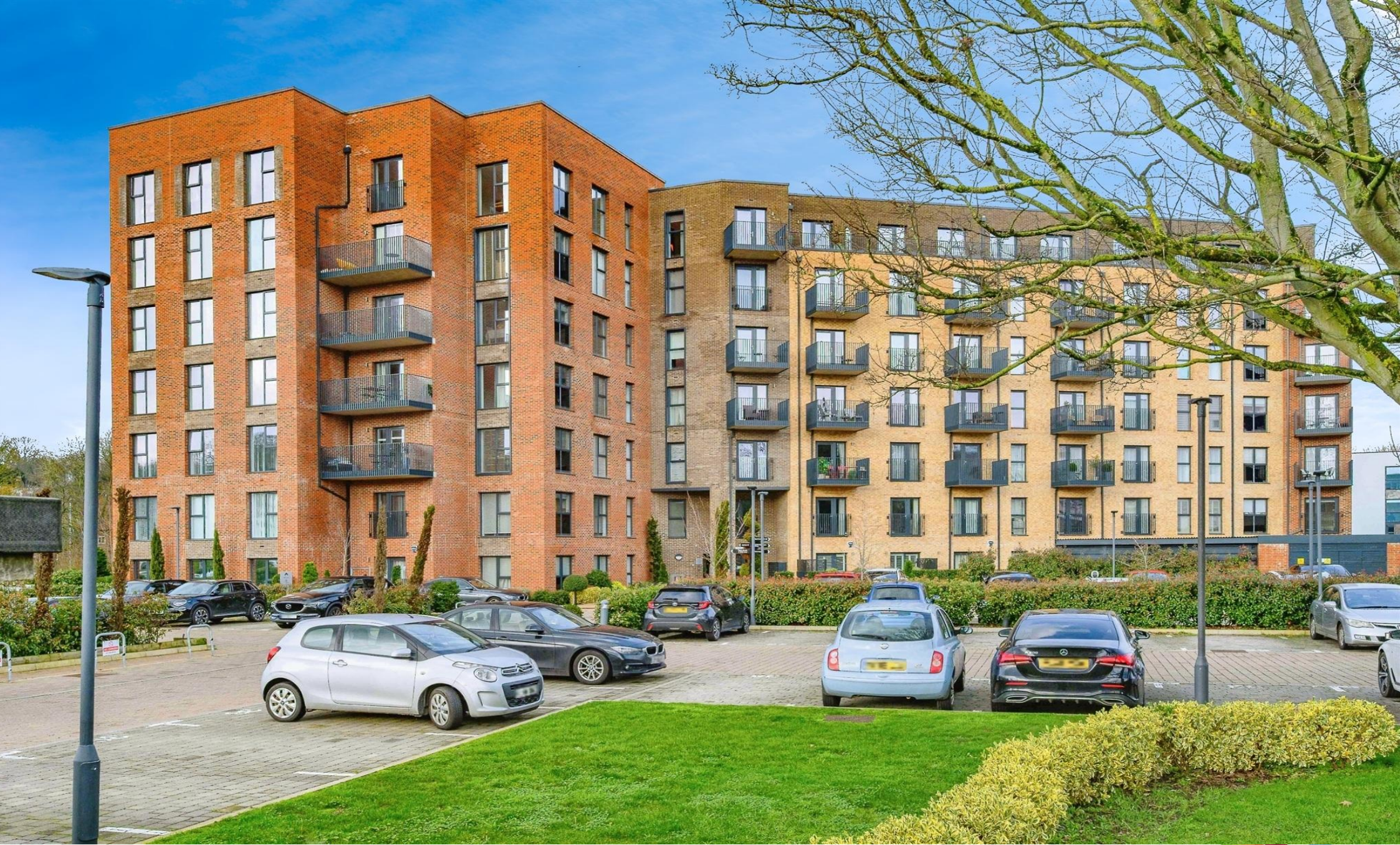
The Foundry Dacorum Way, Hemel Hempstead HP1 1BG