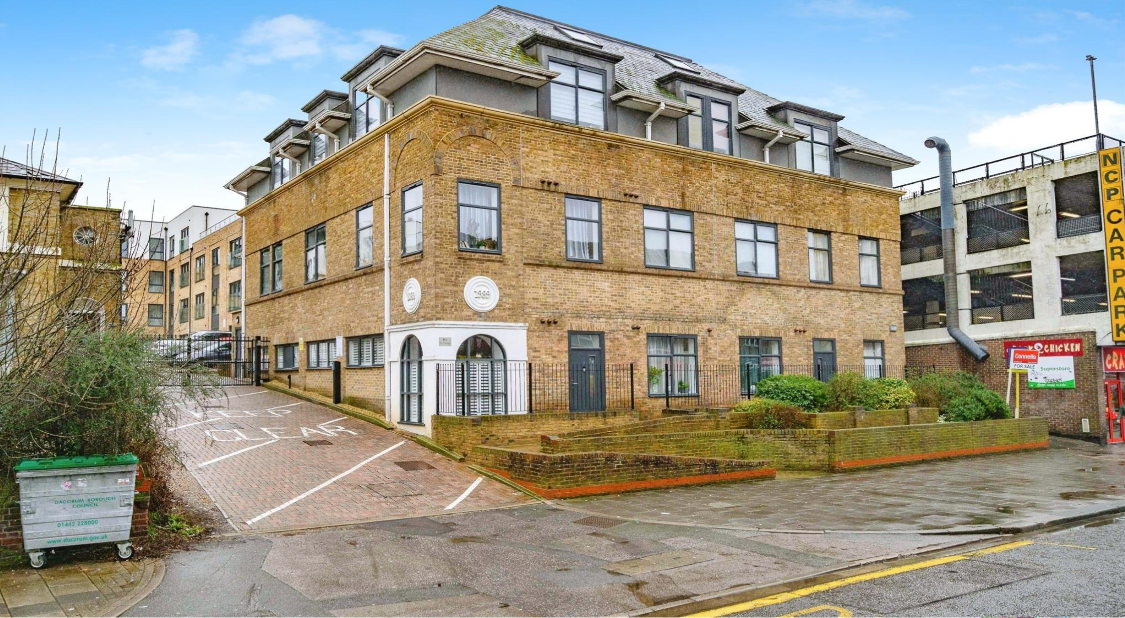
The Exchange Marlowes, Hemel Hempstead HP1 1EH