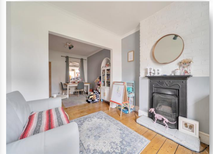
25 Norden Road, Maidenhead SL6 4AZ