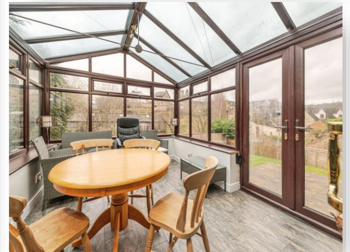
Wood Farm Lane, Brockholes Holmfirth HD9 7AP