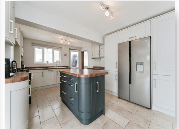
High Street, Doddington PE15 0TF