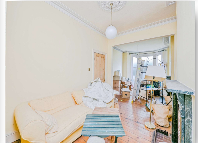
Alfred Street, Roath Cardiff CF24 4TZ