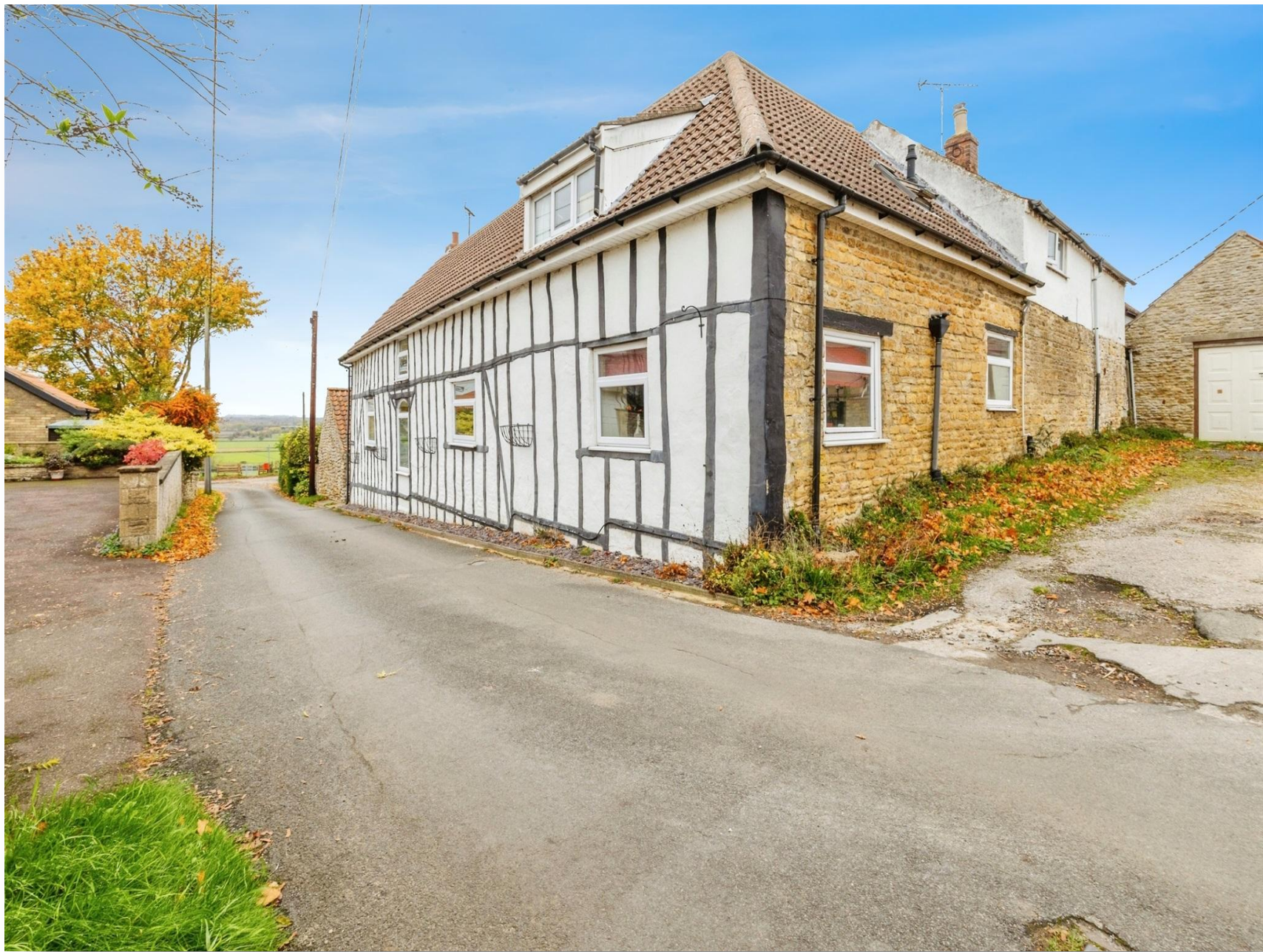
Beam House Blacksmiths Lane, Harmston Lincoln LN5 9SW