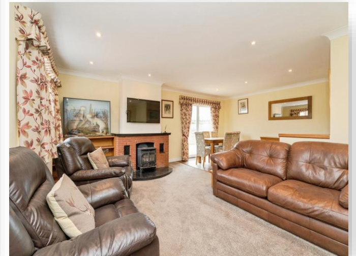
The Cornfield, Langham, Holt, NR25 7DQ