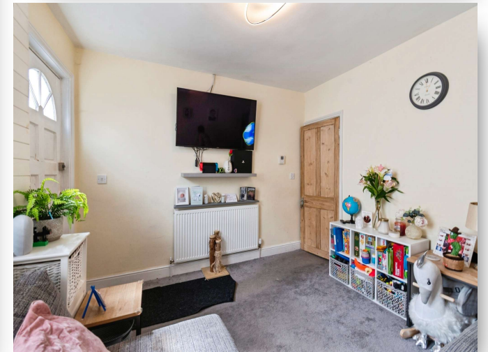
27 Eden Road, Haverhill, CB9 8DX