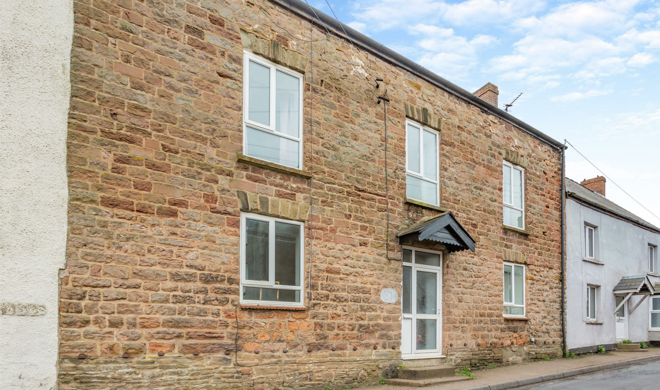
Claymore House West End Ruardean GL17 9TP