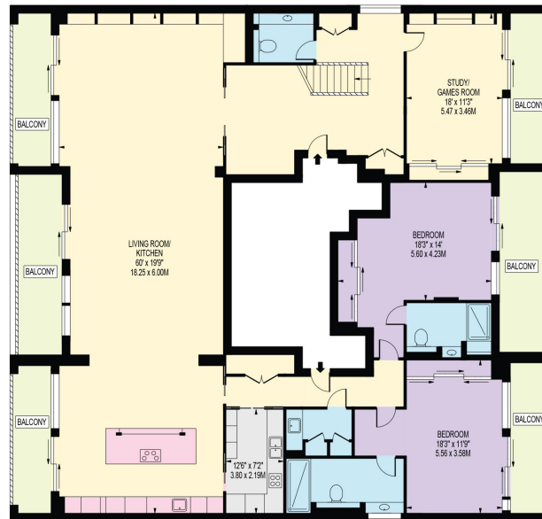
SIXTH FLOOR FOR ILLUSTRATION PURPOSES ONLY

Approximate Gross Internal Area = 360.93 sq m / 3885 sq ft