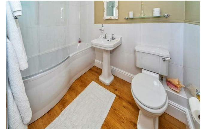
Bath with shower attachment/rain shower. Basin, low suite WC, half tiled walls and chrome heated towel rail.