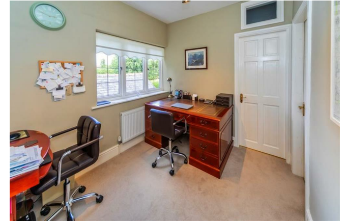
Window with front aspect. Radiator.