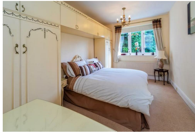
South facing, Fitted wardrobes, radiator.