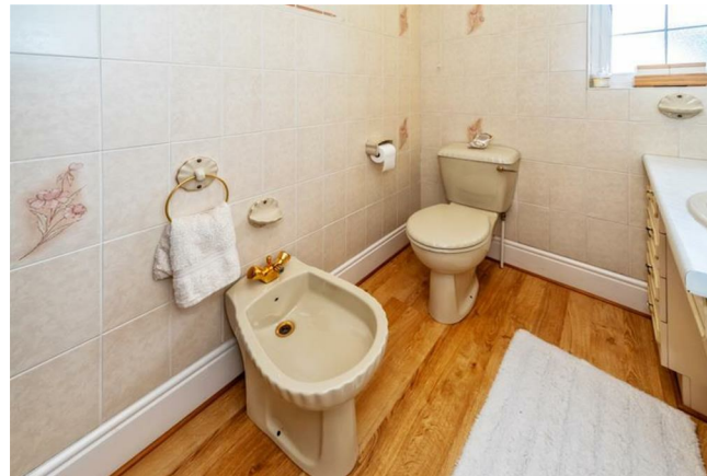
Shower cubicle, low suite WC, basin, bidet, fully tiled walls and fluorescent lighting.