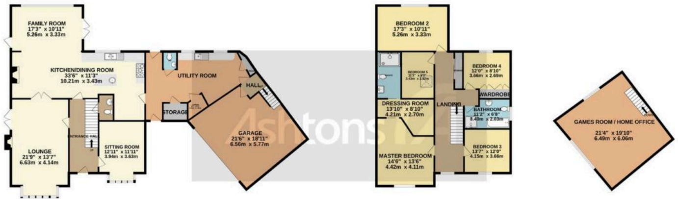
TOTAL FLOOR AREA: 3489 sq.ft. (324.2 sq.m.) approx.

Whilst every attempt has been made to ensure the accuracy of the floorplan contained here, measurements of doors, windows, rooms and any other items are approximate and no responsibility is taken for any error, omission or mis-statement. This plan is for illustrative purposes only and should be used as such by any prospective purchaser. The services, systems and appliances shown have not been tested and no guarantee as to their operability or efficiency can be given. Made with Metropix ©2025