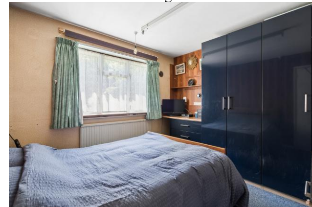
BEDROOM ONE front aspect room with double glazed window, radiator, built in wardrobes.