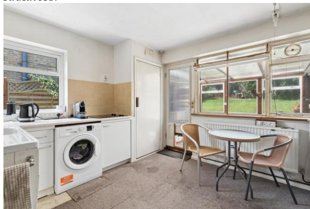
KITCHEN with floor and wall units, double drainer sink, ceramic hob, space and plumbing for washing machine, double glazed window and door to: