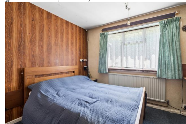
BEDROOM TWO front aspect double glazed window, radiator.