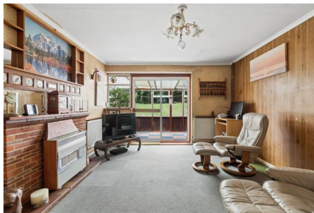
LIVING ROOM rear aspect room with sliding doors to Sun Room, brick fireplace with inset gas fire, radiators.

Part glazed front door to ENTRANCE LOBBY door to ENTRANCE HALL access to loft space, airing cupboard, radiator.