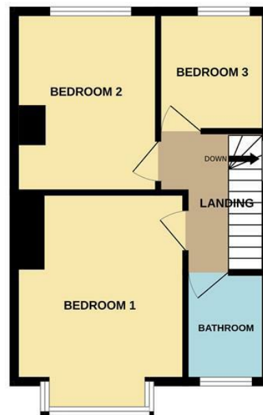
TOTAL FLOOR AREA : 930 sq.ft. (86.4 sq.m.) approx.

Whilst every attempt has been made to ensure the accuracy of the floorplan contained here, measurements of doors, windows, rooms and any other items are approximate and no responsibility is taken for any error, omission or mis-statement. This plan is for illustrative purposes only and should be used as such by any prospective purchaser. The services, systems and appliances shown have not been tested and no guarantee as to their operability or efficiency can be given. Made with Metropix ©2026