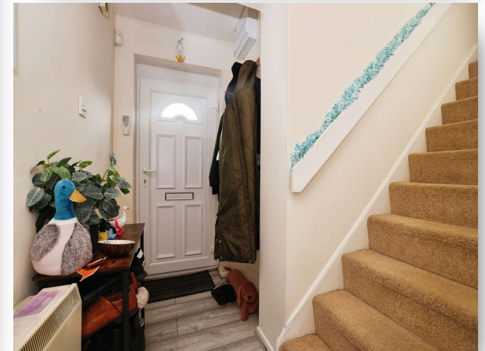
Rider Close, Devizes SN10 2RP