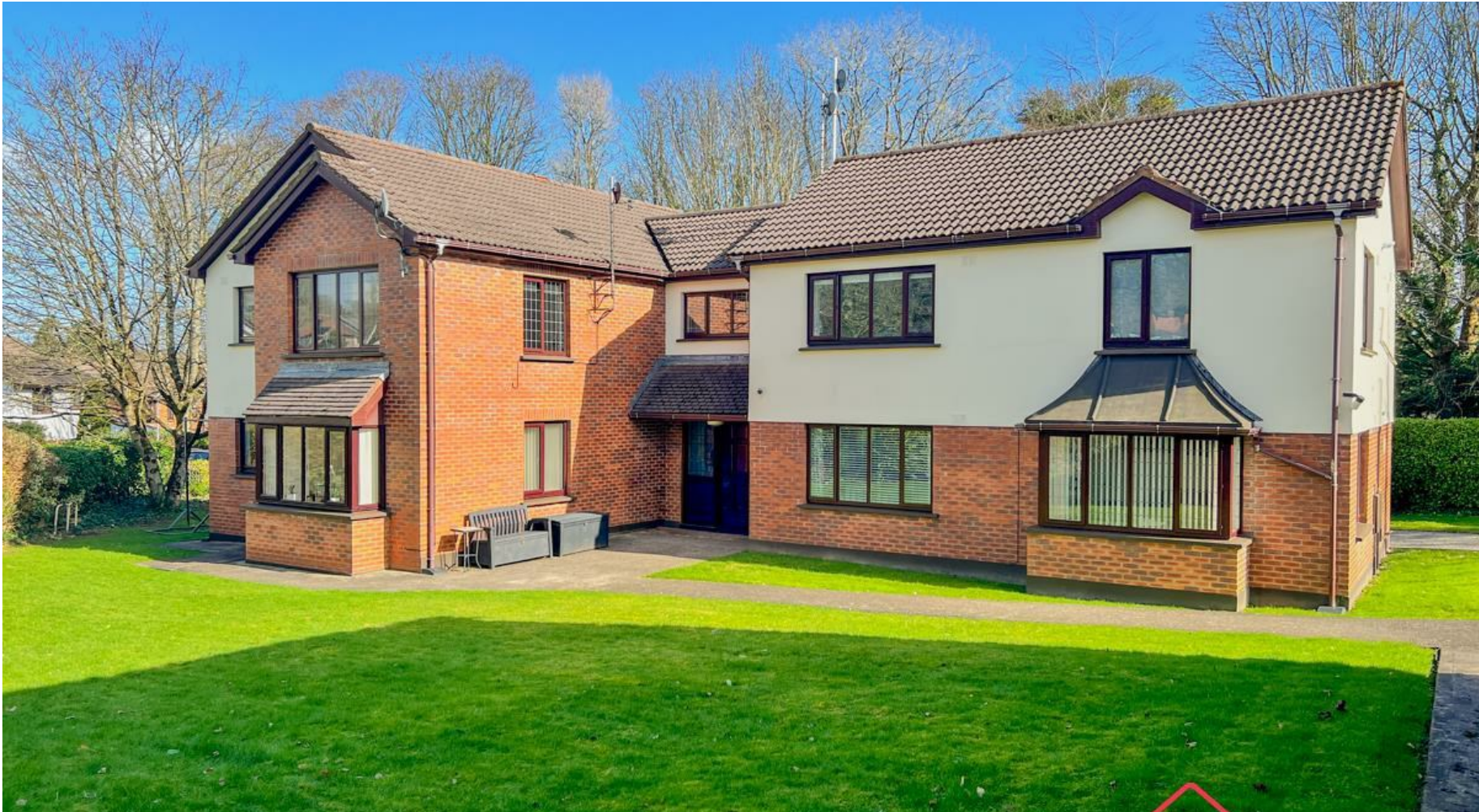
10 Richmond Court, Farmhill, Douglas, Isle of Man, IM2 2NU Asking Price £249,500