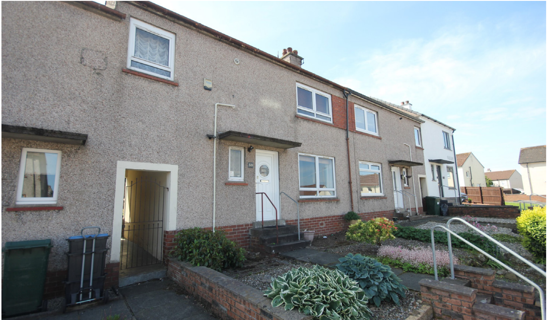
59 Pentland Road, Kilmarnock KA1 3RU Offers Over £99,000