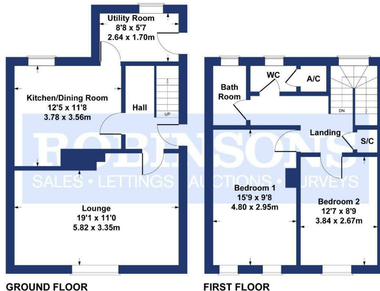
SKETCH PLAN FOR ILLUSTRATIVE PURPOSES ONLY

Approximate Gross Internal Area 940 sq ft - 87 sq m