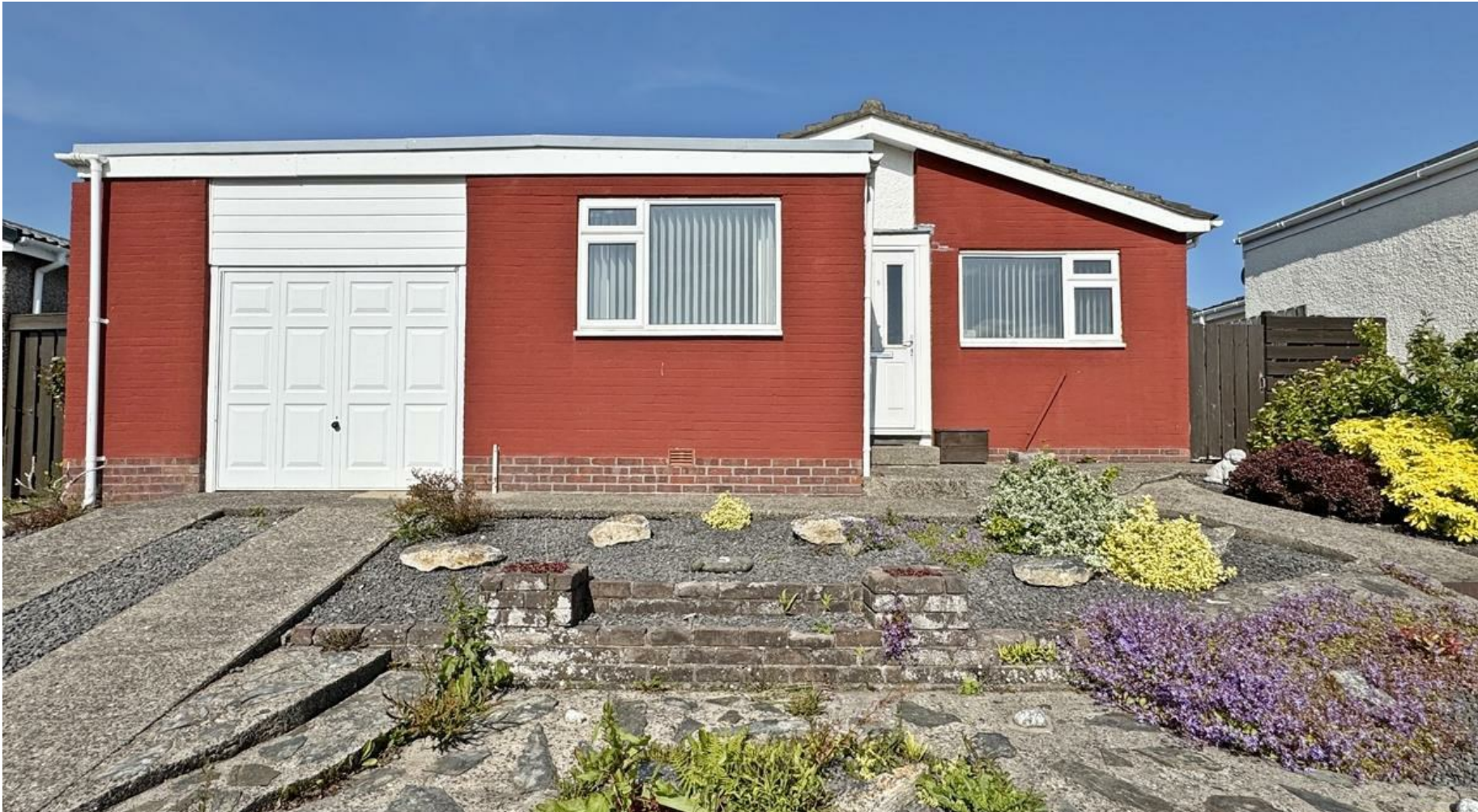
5 Hillberry Close, Douglas, Isle Of Man, IM2 6HP Asking Price £315,000