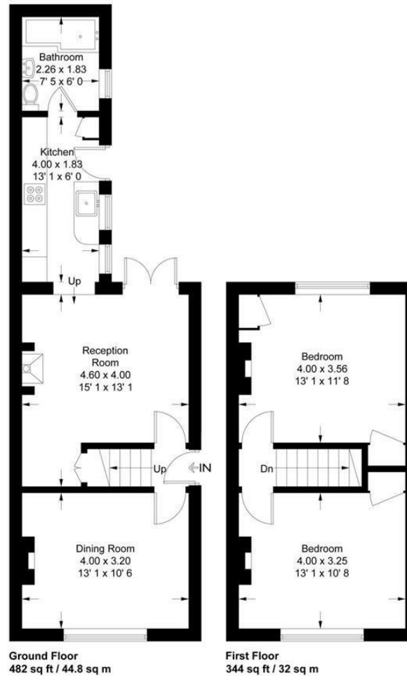
Ground Floor 482 sq ft / 44.8 sq m