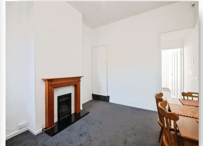
Tintern Road, Birmingham B20 3HL