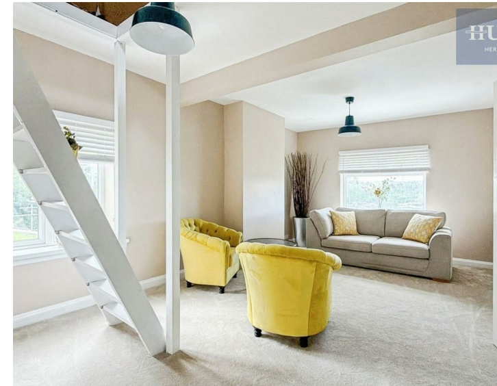
Bedroom one (ground floor) 11'3" x 10'0"