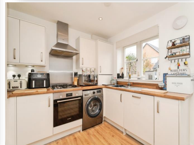
Partridge Way, HOLT NR25 6GG