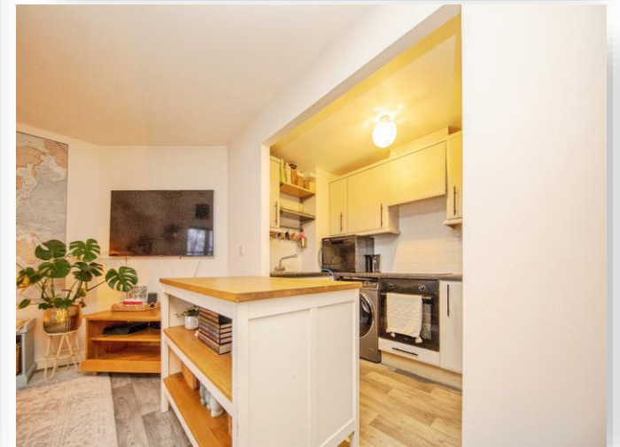
Alnesbourn Crescent, Ipswich, IP3 9GD