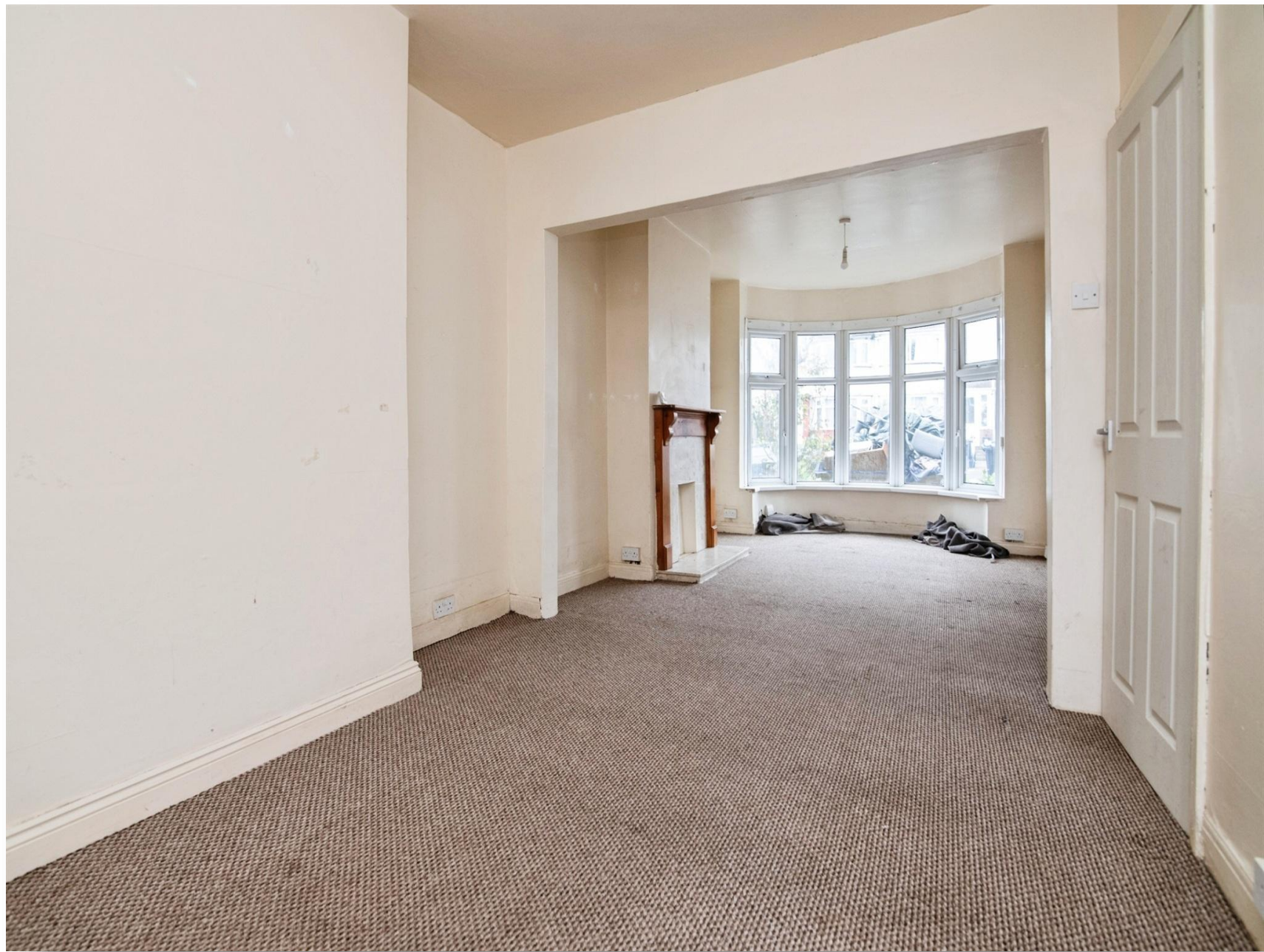
Sandringham Road, Birmingham B42 1PQ